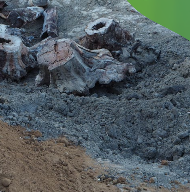
BROWNS PARK LAGOON (FISH PARK)

2010 Initial discussions begin on restoration of the lagoons for social and ecological goals. Lagoons group is formed and planning begins.